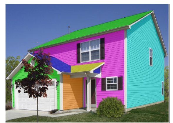
Example 1A: Home Masked