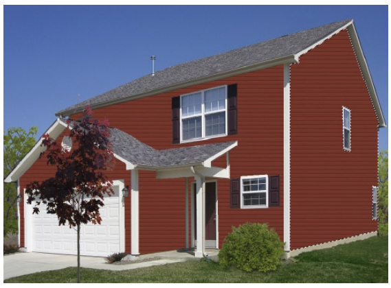
Example 1B: Home with Product Applied