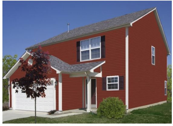
Example 1C: Home with Perspective Applied