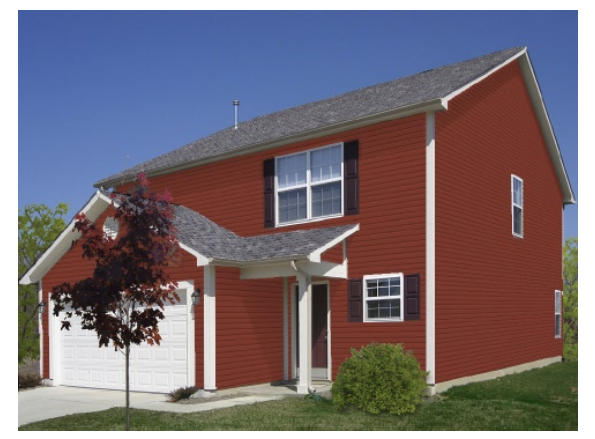
Example 1F: House with Light Shading