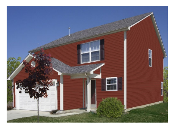
Example 1E: House with No Shading