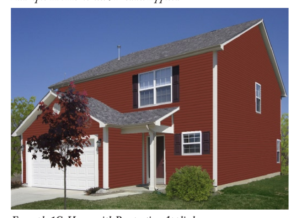
Example 1C: Home with Perspective Applied