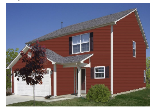
Example 1B: Home with Product Applied