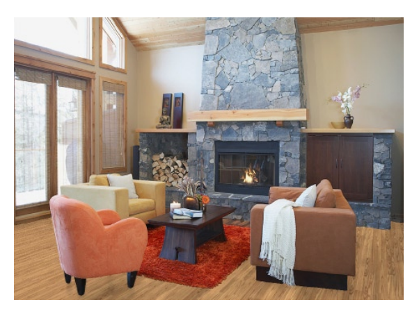
Example 1E: Interior with No Shine