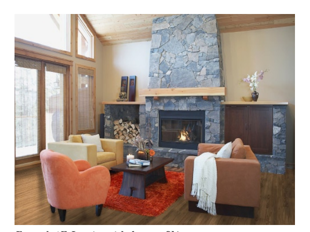
Example 1F: Interior with Average Shine