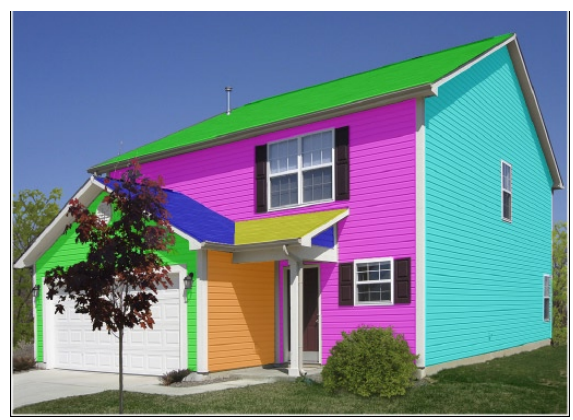
Example 1A: Home Masked