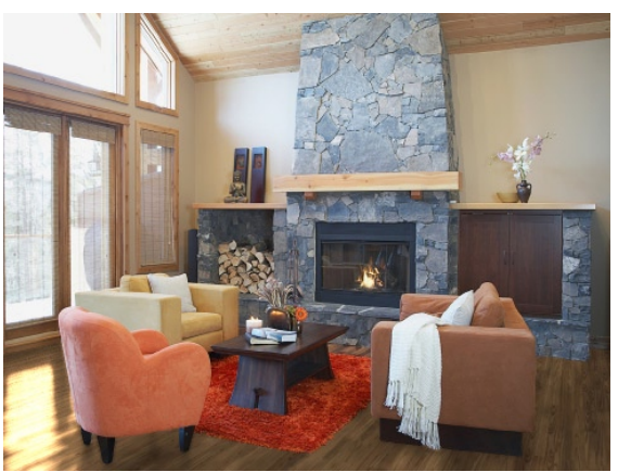
Example 1H: Interior with Light Shine

Notice the difference in shine in the four examples above, see how the shine progressively gets brighter, and changes the atmosphere of the image. You can see a significant difference in the level of shine on the flooring between Example 1E and 1H. Practice using shine, so that you too can achieve realism in your photos!