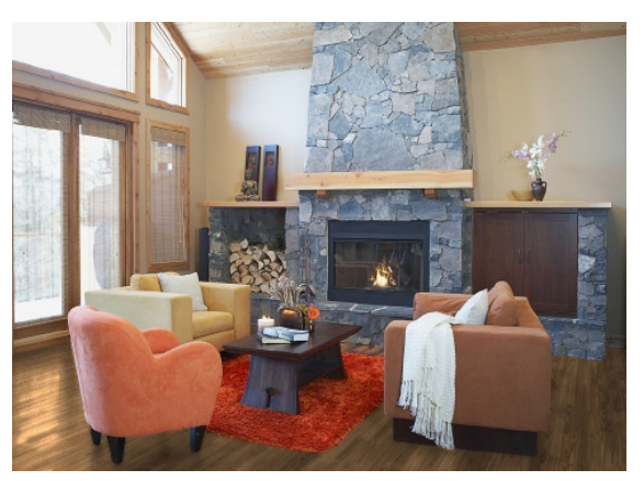
Example 1G: Interior with Soft Shine